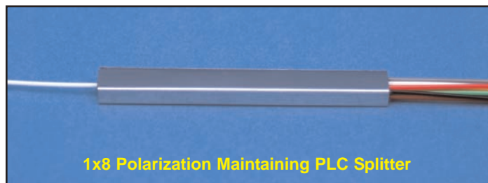
1x8 Polarization Maintaining PLC Splitter

In general OZ Optics uses polarization maintaining fibers based on the PANDA fiber structure when building polarization maintaining components and patchcords. However OZ Optics can construct devices using other PM fiber structures. We do carry some alternative fiber types in stock, so please contact our sales department for availability. If necessary, we are willing to use customer supplied fibers to build devices.