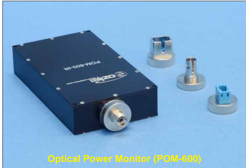
Optical Power Monitor (POM-600)