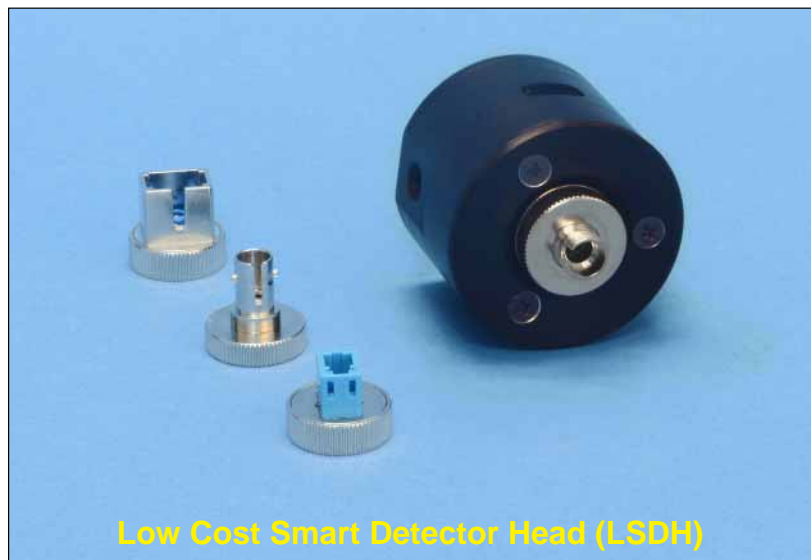
Low Cost Smart Detector Head (LSDH)

OZ Optics also offers equivalent units with built-in displays. The POM-500 product datasheet can be accessed at the following link: https://www.ozoptics.com/ALLNEW_PDF/DTS0150.pdf