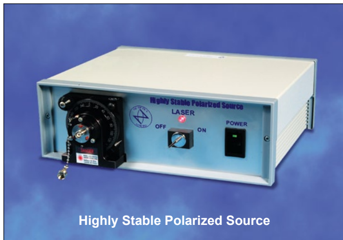
Highly Stable Polarized Source

Accessories include master reference patchcords for confirming the performance of the source, and power cords for regions outside of North America. Extinction Ratio Meters are also available for measuring the output polarization from a fiber. See the data sheet titled Polarization Extinction Ratio Meters for further details.