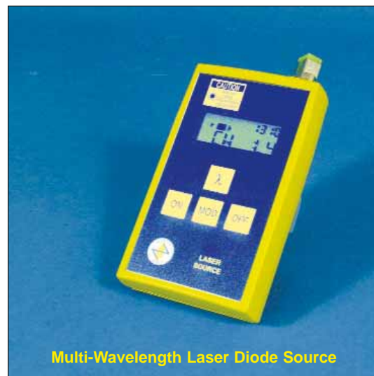
Multi-Wavelength Laser Diode Source

OZ Optics recommends angled connectors for improved stability. For 1300nm and 1550nm wavelengths, an isolator can be added for improved stability. OZ Optics also manufactures the Highly Stable Laser Diode Source ( HIFOSS ), which includes a temperature controller and an isolator. See the Highly Stable Laser Diode Source data sheet for more information on this product.