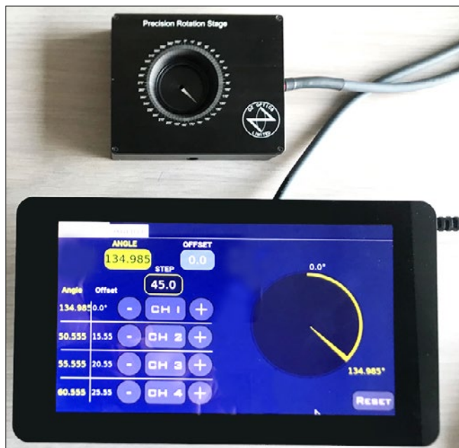
Fig.2. A single rotation stage along with a control unit and built-in touch-screen is powered up using 5V DC power supply.